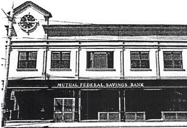
The Mutual Federal Savings Bank in Whitman.